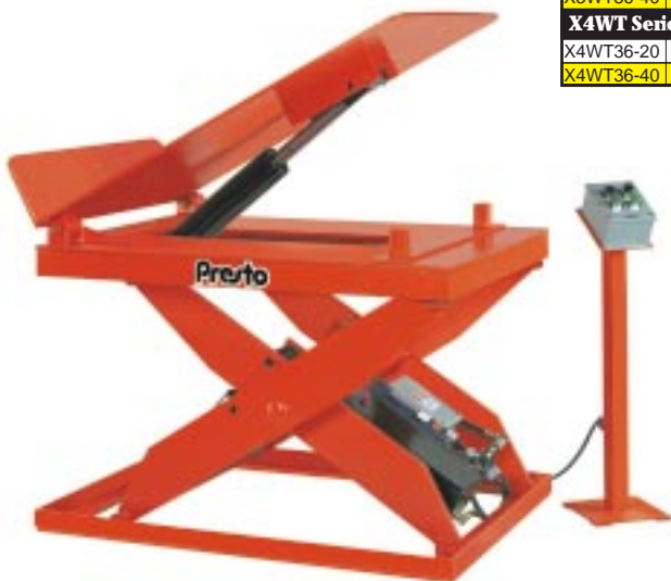
Shown with optional control pedestal